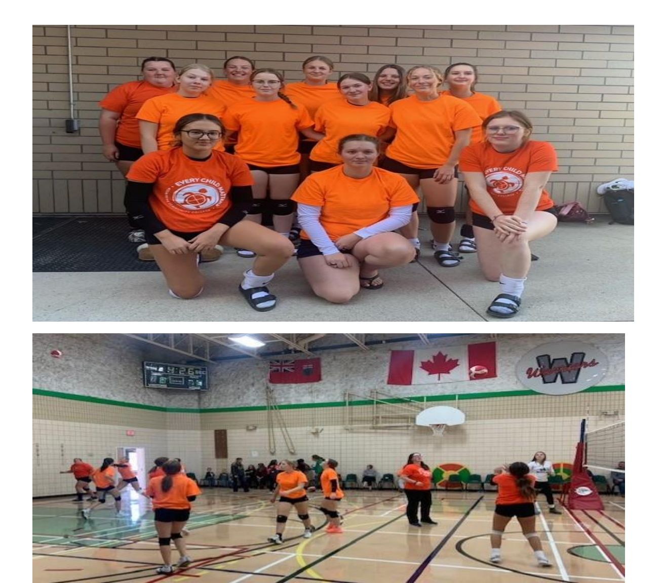
RCI Hockey Skills Academy Orange Shirt Project